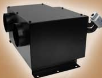
Dual-Blower HVAC Box