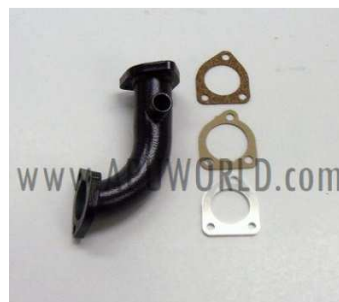
RP5-1006K – Thermostat extension kit

The Thermostat in the cooling system on some engines can be influenced by heat from the nearby exhaust manifold. Depending on the configuration of the Thermostat assembly, your RigMaster may or may not have this issue. A spacer kit can be installed that has a 90 degree steel elbow which relocates the Thermostat away from exhaust heat (RP5-1006k kit and instructions are hosted in this part of the website). If your engine has an Aluminum Thermostat housing, be aware that it can easily absorb and conduct exhaust heat to the Thermostat. Even though the Aluminum spacer housing relocates the Thermostat, it may need to be replaced by the steel elbow instead.